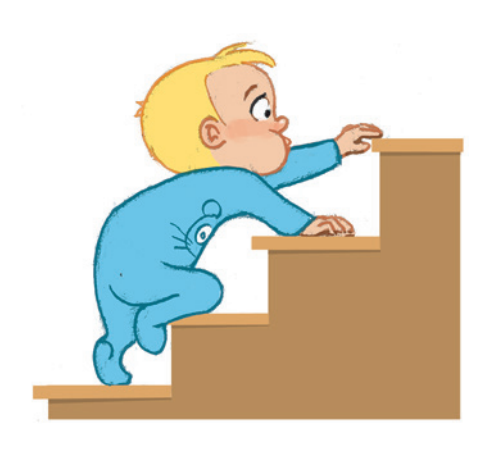
... Learn my limits and avoid injuries