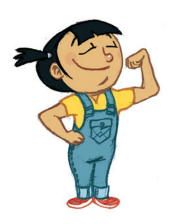
... develop strength and dexterity