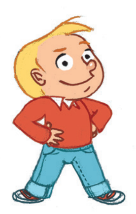
... build my self-confidence