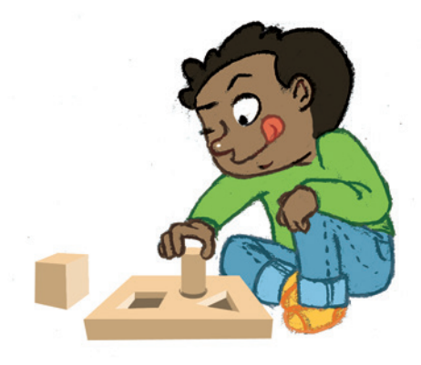
... engage in uninterrupted play