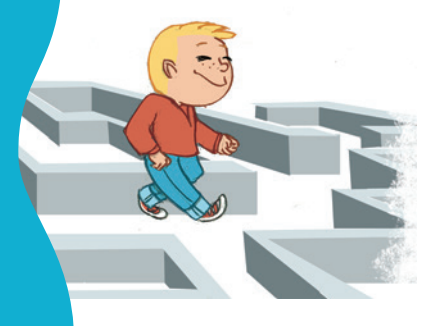
... get oriented in space and time