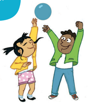
... play in a group