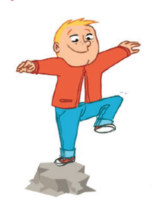
... control my movements and improve my sense of equilibrium