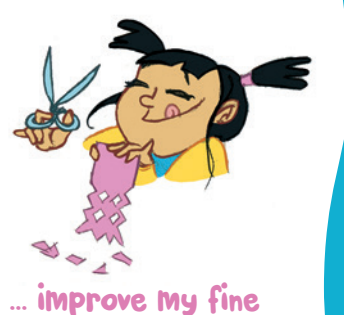
.. improve my fine motor skills